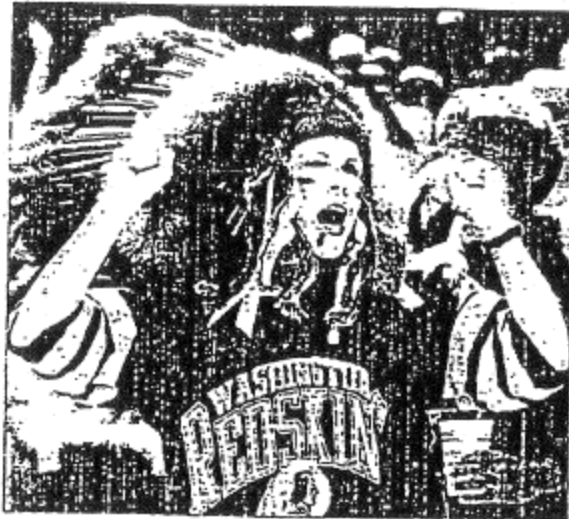
The Indian Girl cheers on the Redskins during their opening game.