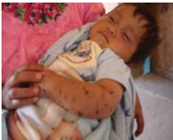
Photo Credit: Sipacapa and San Miguel Ixtahuacan, San Marcos Guatemala; This is a photo of a child with disease of the skin, similar to many women and children who live in proximity to the area of gold and silver exploitation.

The nearby Mayan Indigenous communities report contamination of ground water affecting food production, chronic illnesses among the children, persistent skin diseases and liver cancers, forced displacement of families and political repression of protesters. Communities have consistently expressed strong opposition through a number of formal and well-documented referendums which have been consistently ignored and disregarded by both the Guatemalan and Canadian governments.