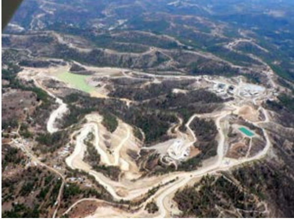
Photo Credit: Sipacapa and San Miguel Ixtahuacan, San Marcos Guatemala; This is an aerial shot of the mining company's operations, which cause destruction of biodiversity, contamination of water by cyanide, natural resources, etc..

Marlin 1 open pit strip mine, which uses highly toxic sodium cyanide for ore extraction, is located in the Indigenous municipalities of Sipacapa and San Miguel Ixtahuacán and has been the focus of controversy and opposition by local communities since it was established in 2004.