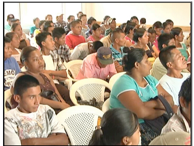
SATIIM and Maya communities’ press conference held on Tuesday 23 rd July 2013.

The Maya communities are upset because for more than a decade their rights to access resources in the park have been denied even though it’s a part of their territory; but, overnight the government has allowed U.S. Capital Energy, a US oil company, to carry out oil exploration in it.