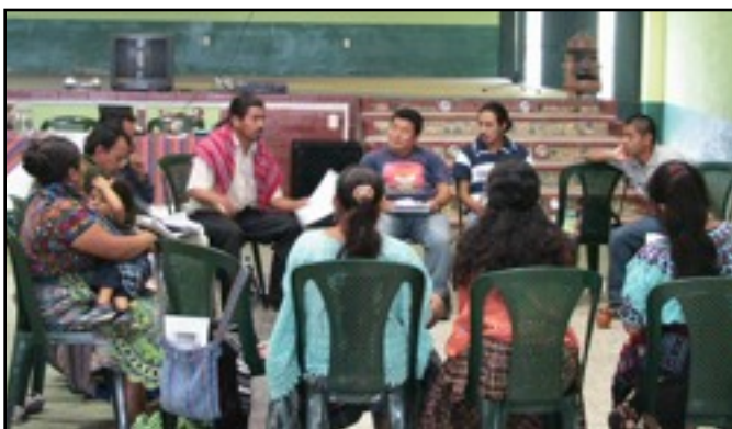
IITC Cultural Indicators workshop, Chimaltenango, Guatemala, June 2008.

The Cultural Indicators for Food Sovereignty, Food Security and Sustainable Development were developed by Indigenous Peoples in partnership with the UN Food and Agricultural Organization (FAO) at the 2nd Indigenous Peoples' Global Consultation on the Right to Food and Food Sovereignty in Bilwi Nicaragua (2006). They offer a practical tool for Indigenous communities to assess current strengths, trends and threats, including the traditional cultural practices, knowledge and relationships related to their traditional food systems, and to develop effective strategies to defend, protect and restore their Food Sovereignty. Training workshops on using the Cultural indicators are carried out by IITC in a number of Indigenous communities.